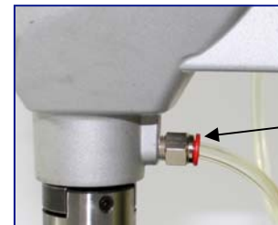
AC3508Q Coolant Connector

For more info call customer service at 1-800-645-3957 or visit us at www.championcuttingtool.com