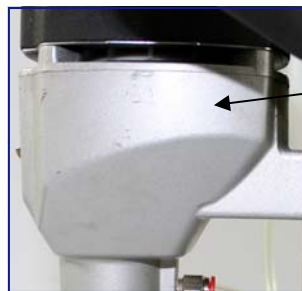
AC3517Q Gearbox Housing