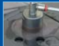
RAPID PENETRATION USING PILOT PIN & DIAMOND CROWN