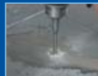
SMALL DIAMETER PTC DRILL USED FOR ACCURATE PILOT HOLE