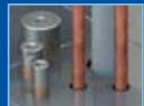
CLEAN & ACCURATE LARGE DIAMETER HOLES