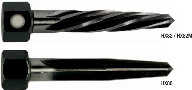
HX82 / HX82M